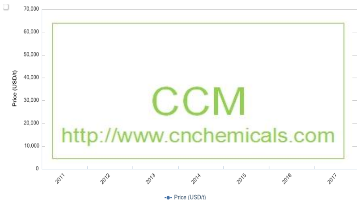
Figure 1.2.1-1 Annual ex-works price of azoxystrobin technical in China, 2011–2017

Note: The data in 2011–2013 were for 95% azoxystrobin technical and in 2014–2017 were for 96% azoxystrobin technical.